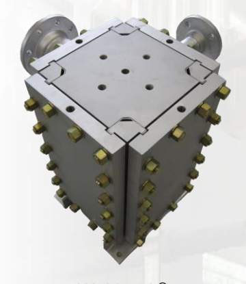
Weldpack® Welded Plate Heat Exchangers (without gaskets between plates)

Design Pressure: Vacuum / 50 barg Design Temperature: -40 °C / 400 °C